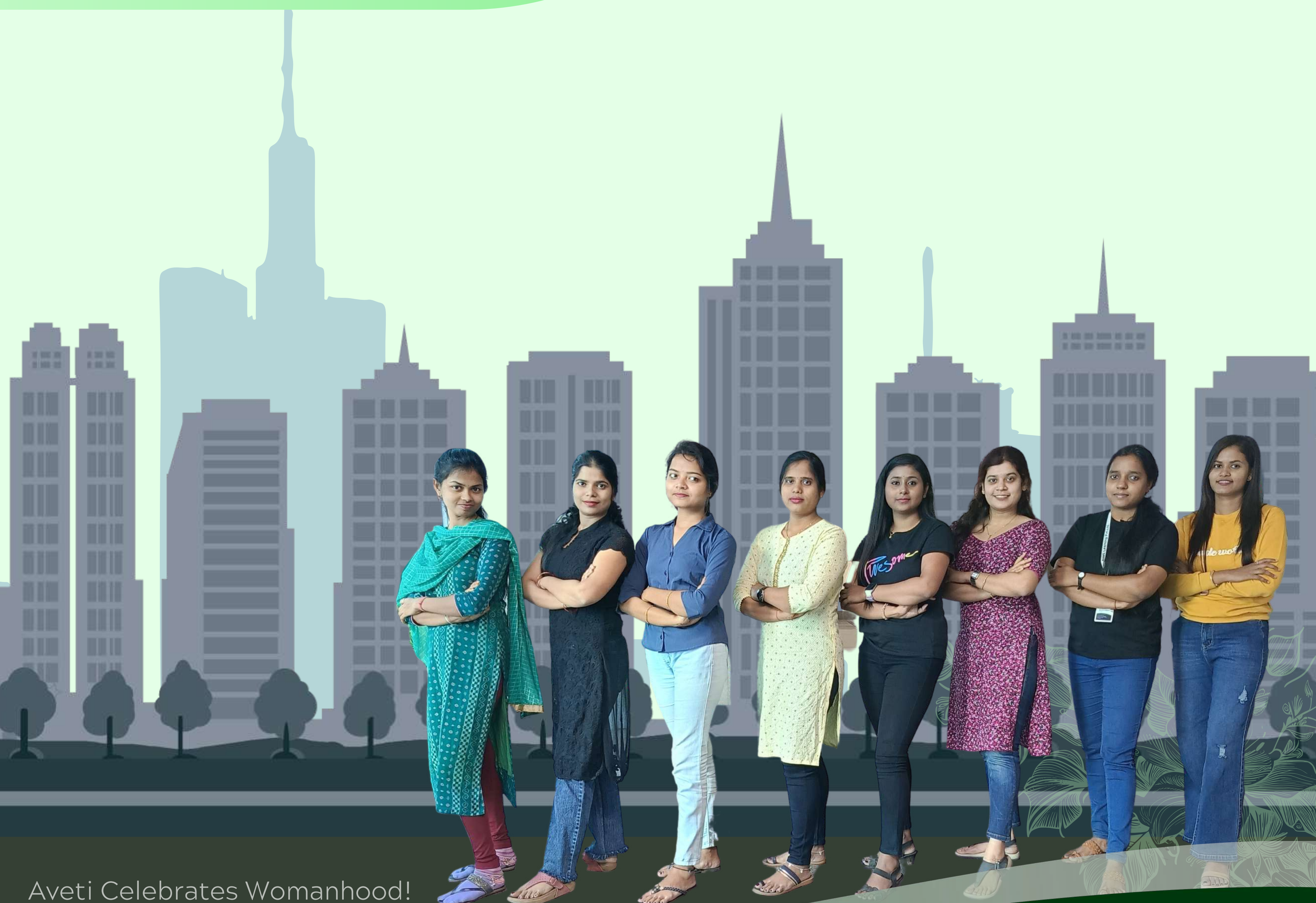
Aveti Celebrates Womanhood!